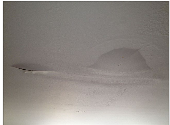
BUBBLING AND PEELING PAINT ON INTERIOR CEILING