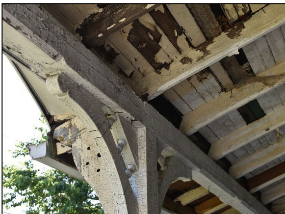
PEELING PAINT ON EXTERIOR FRONT PORCH