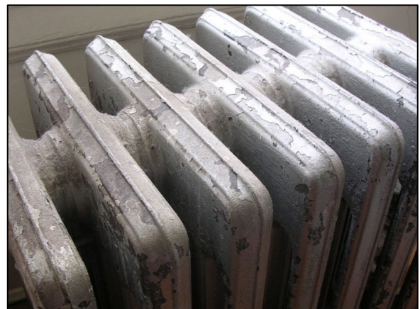
PEELING PAINT ON INTERIOR RADIATOR