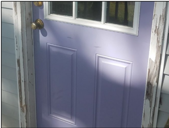
PEELING PAINT ON EXTERIOR DOOR FRAME

These conditions "fail" and prevent us from completing the inspection. They will result in a return trip with associated fee.