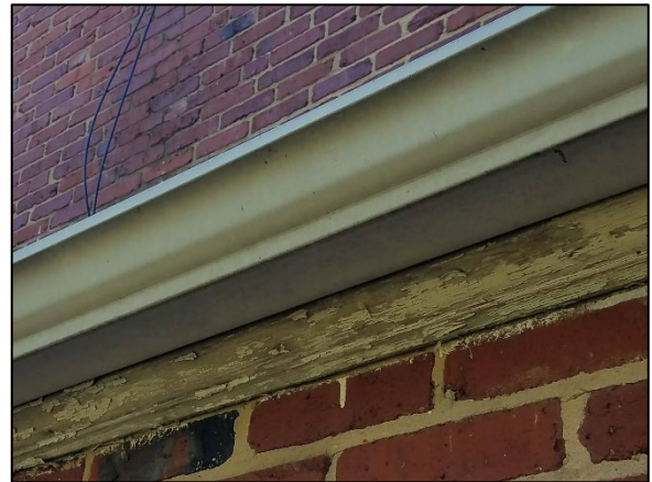
PEELING PAINT ON EXTERIOR TRIM